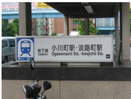
Ogawamachi, Awajicho A1