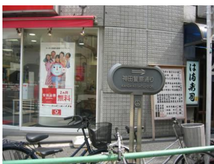
Kanda Keisatsy Dori