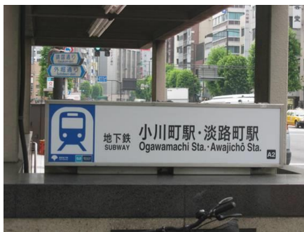
Ogawamachi, Awajicho A2